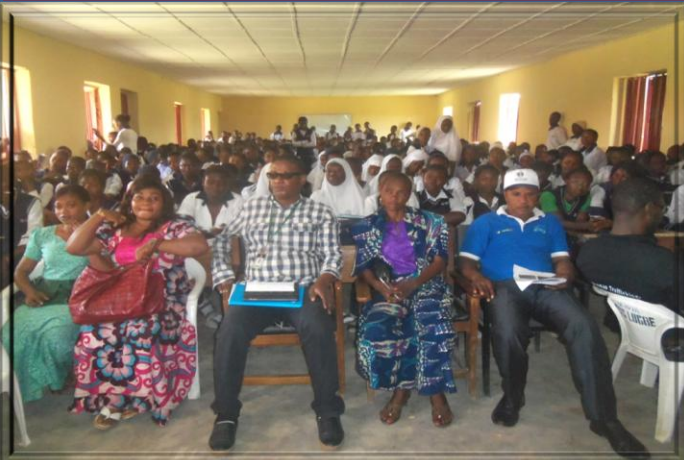
A Cross section of the Students singing the National Anthem