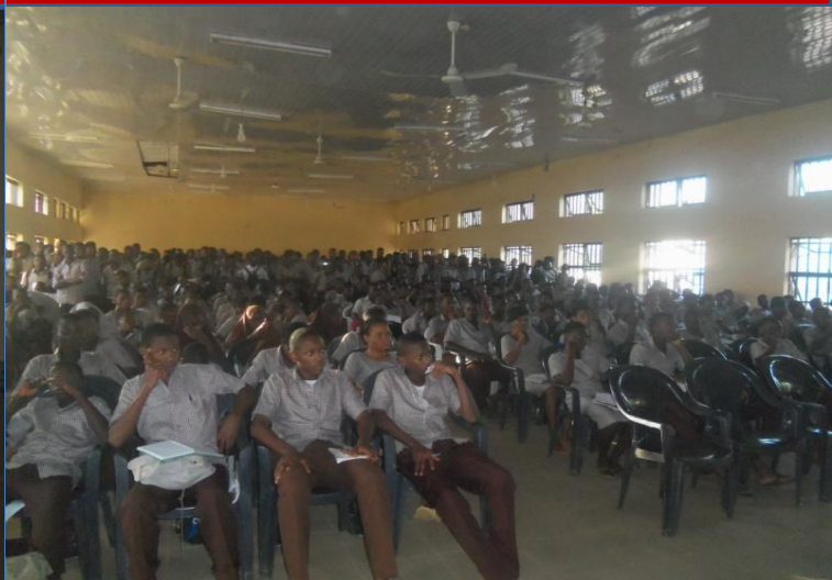
A cross section of the students during the workshop