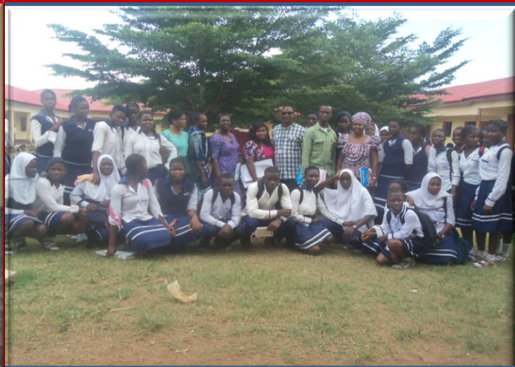
Some of the resource persons, students and staffs posing in the picture