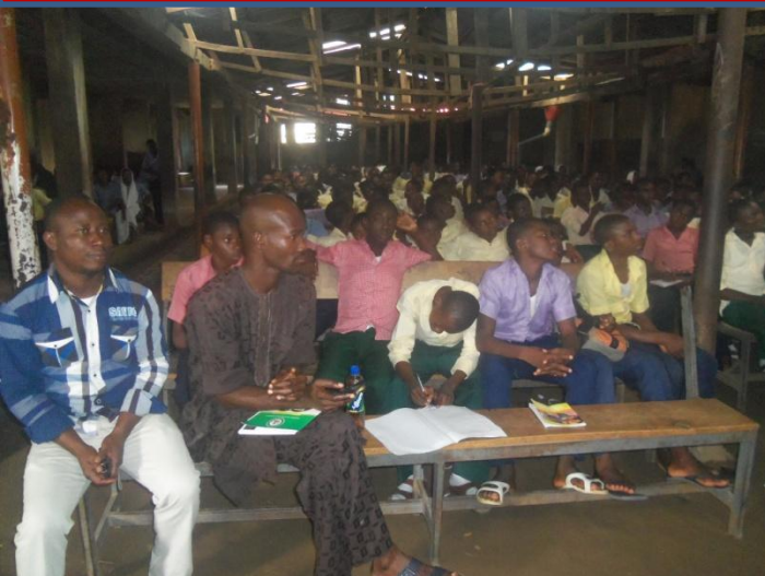
A cross section of the students watching and listening to the documentary presented by NAPTIP