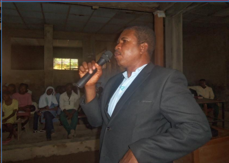
A cross section of the students during the workshop