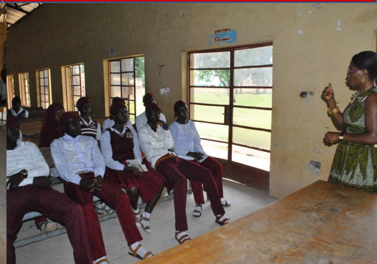
Some of the Deaf students at GSS Kuje watching their instructor, during the workshop