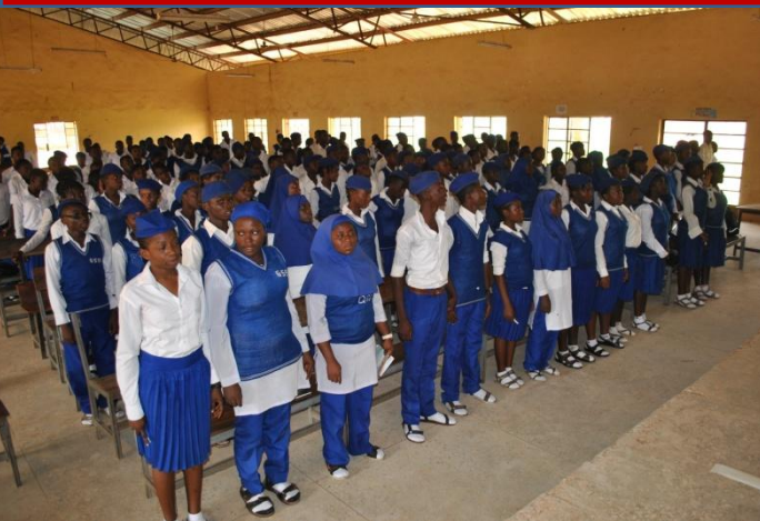
A Cross section of the Students singing the National Anthem