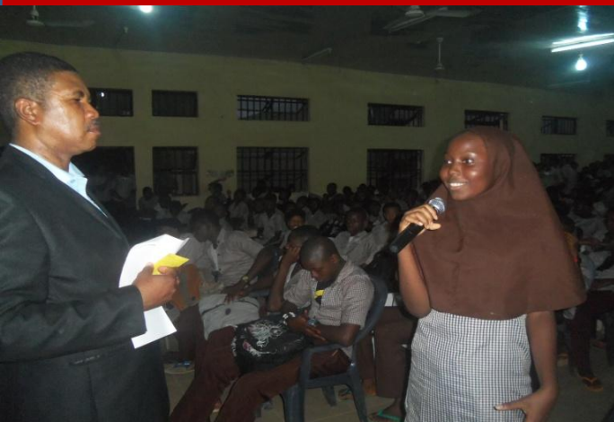
A student asking question to the Resource Person from NAPITP