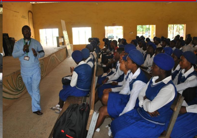
A resource person from NAPTIP speaking to the students on Sex trafficking and Social Media.