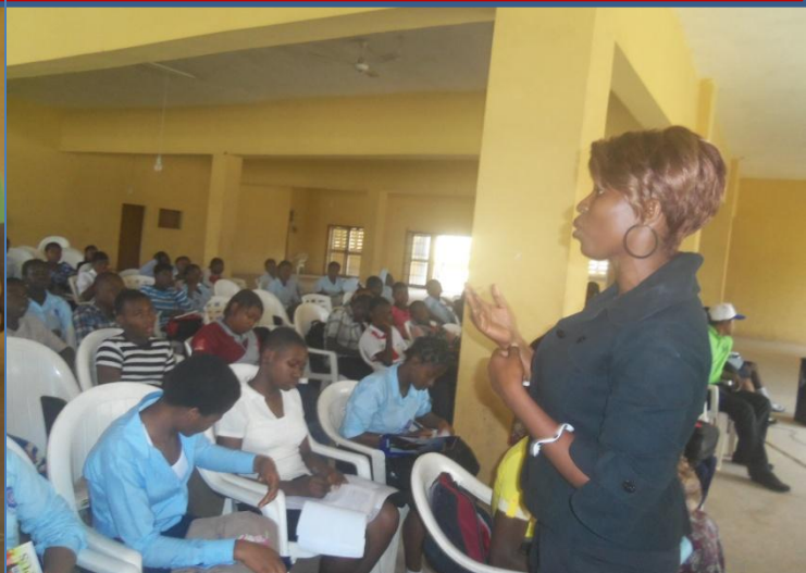
A cross section of the students during the workshop