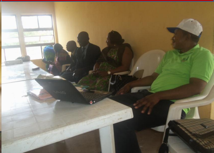
A section of the Resource Persons, NYSC official, FCT Education Board and GSS Principal.