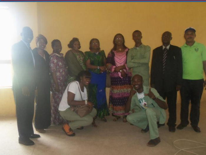
The FCT Secondary Education Board, GSS Principal, NYSC officer, Resource Persons and Corps Members