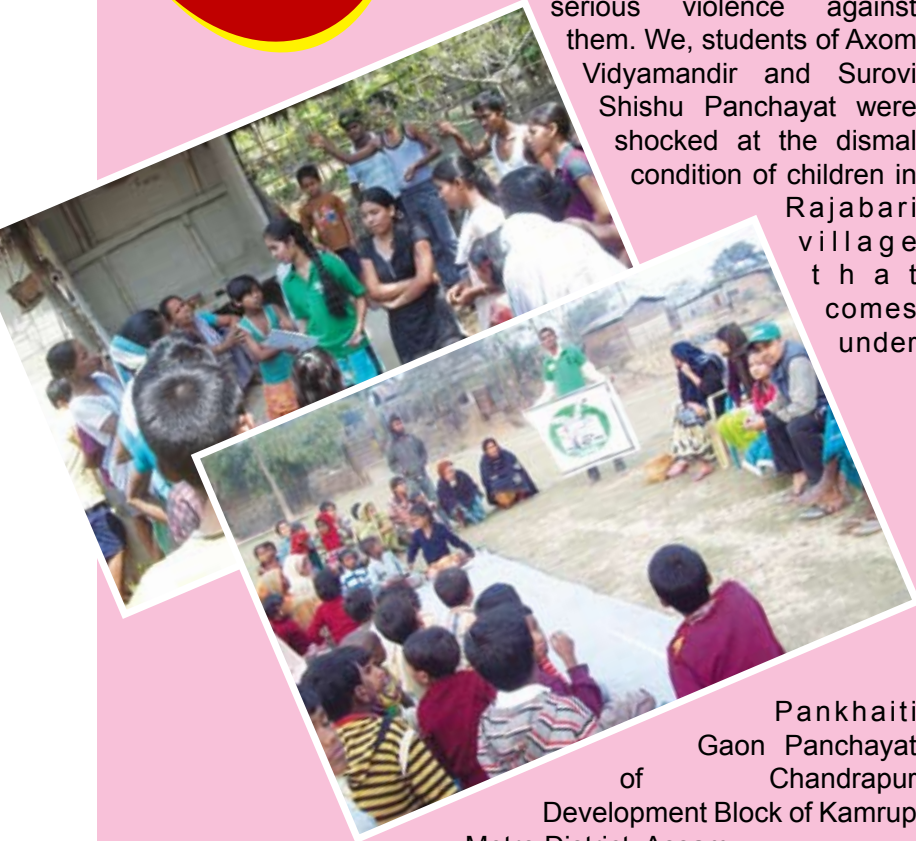
Pankhaiti Gaon Panchayat of Chandrapur Development Block of Kamrup Metro District, Assam.

Depriving children of basic facilities should be considered as serious violence against them. We, students of Axom Vidyamandir and Surovi Shishu Panchayat were shocked at the dismal condition of children in Rajabari village that comes under