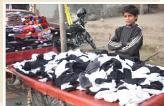
Lost childhood: A little boy in Srinagar selling woolen items