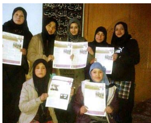
The Peace Gong Ladakh young reporters

In some far-flung villages of Changthang, Turtuk, Tyakshi, Nubra and Zaskar in Ladakh there are no proper schools for the children. This is the reason why many parents are unable to obtain school education for their children. The nomads of Changthang, who keep moving from place to place in search of food for their livestock, cannot get their children admitted in any schools. Just for the sake of educating their children, many poor people of these villages are compelled to hand over their children to richer town-dwellers. Families who are